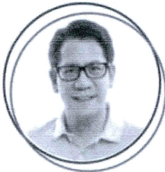
HON. Roman Romulo District Representative, Pasig City Lone District House of Representatives